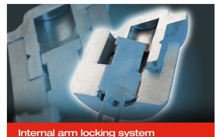
Internal arm locking system