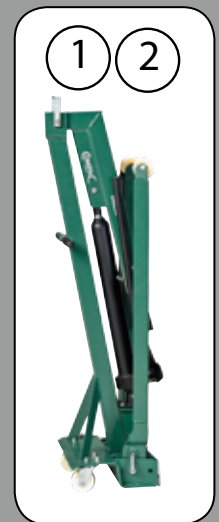
Foldable. Takes up limited space when not in use.