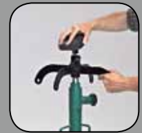
Reversible transmission adaptor with saddle and rubber pad.