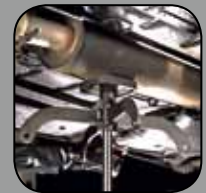
Ideal for handling and supporting exhaust systems, fuel tanks, etc.