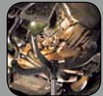
Large transmission adapter. Practical fixing points.